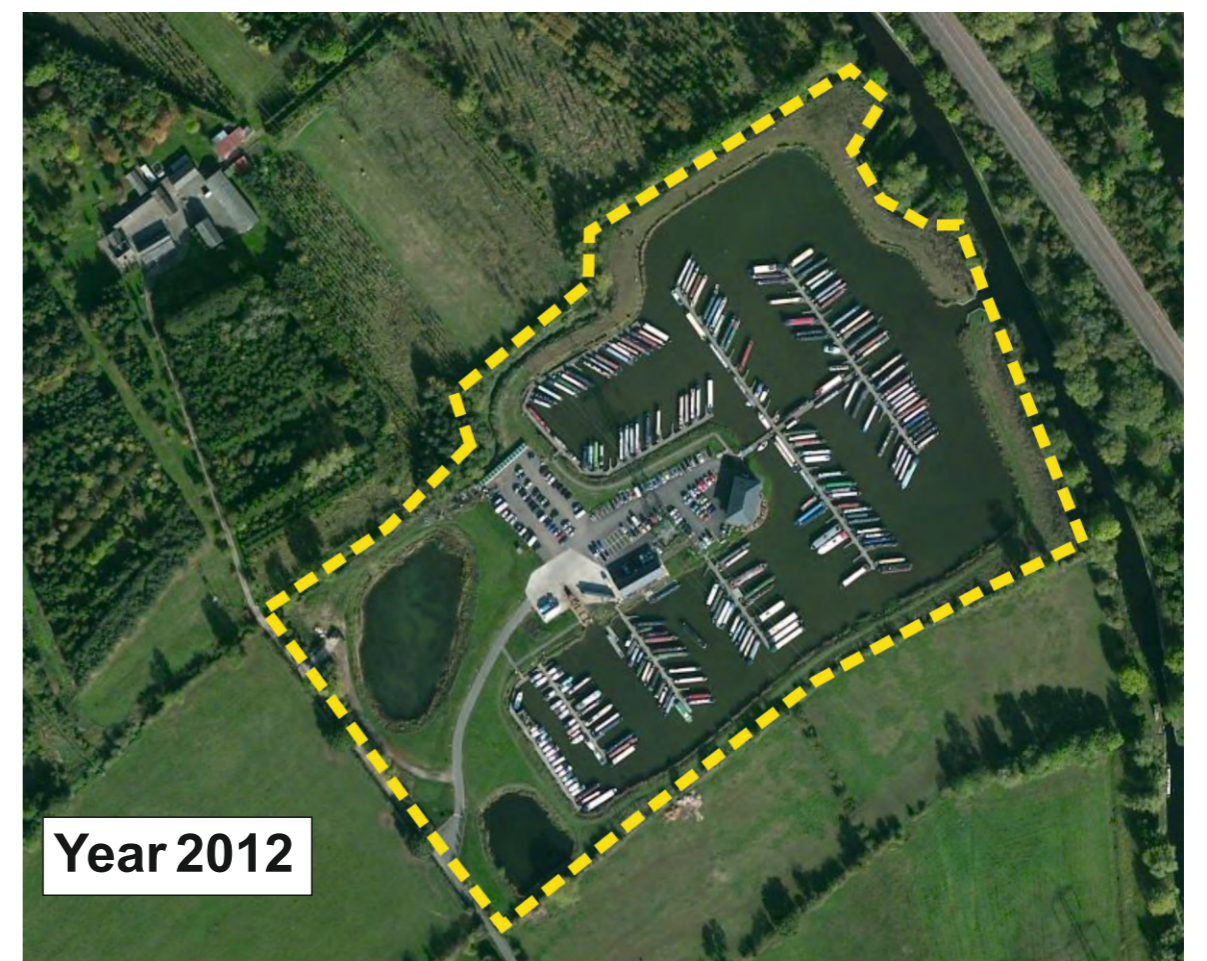
Evolution of Pillings Lock Marina